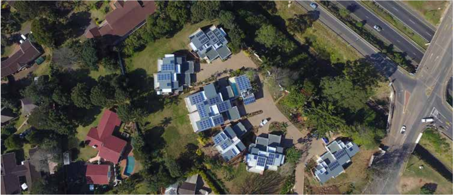
AdSolar Efficiently used up most of the available roof space to install all the PV modules needed to power the development. Each home is fitted with a 5 kW Conext RL grid tie inverter that is AC coupled on the multi-cluster storage system

Schneider Electric and AdSolar collaborated to build a unique solution giving energy independence and self-sustainability to a high end residential estate development in South Africa using community level centralized storage with decentralized power generation.