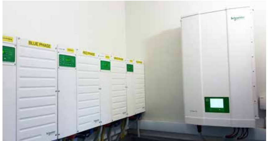
The multi-cluster is made up of 9 x 8.5 kW Conext XW+ inverters, which are all connected to a 5600Ah battery bank. In the battery room, a 20 kW Conext TL grid-tied inverter also manages the harvesting of additional solar energy