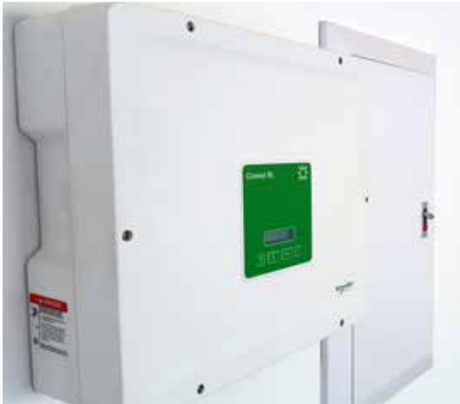
5 kW Conext RL Inverter installed in each home